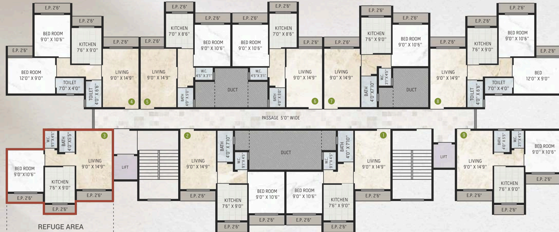
Wing - C 1st to 7th & 9th to 12th